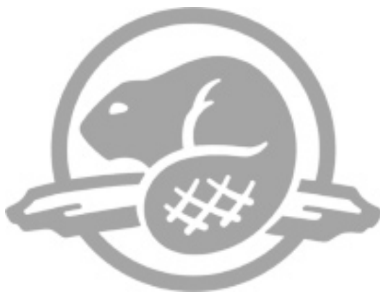
Parks Canada logo.

Gain a strong foundation for teaching about Canada while exploring two of our neighbor's most beautiful, cosmopolitan and environmentally sustainable cities. Travel awards available.